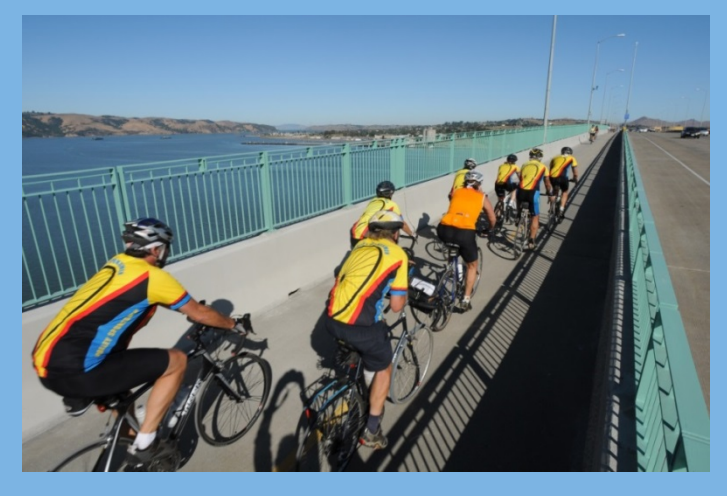
The Benicia-Martinez Bridge Path—part of the SF Bay Trail & The Bay Area Ridge Trail